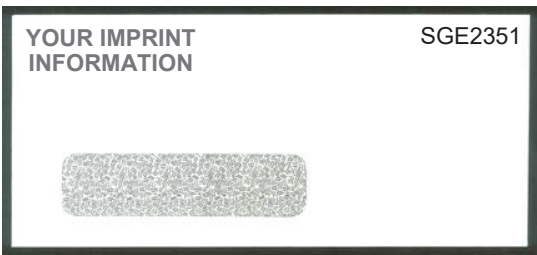
#9 SINGLE WINDOW—Size 3 7/8 x 8 7/8 Window 7/8" from left, 11/16" from bottom Window size: 3 1/2" x 15/16"

Window 7/8" from left, 1/2" from bottom Window size: 1 1/4" X 4 1/2"