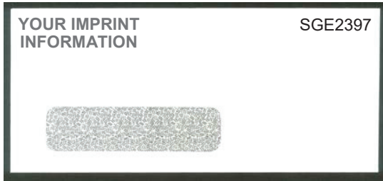
STANDARD #10 SINGLE WINDOW SIZE 4 1/8 X 9 1/2

(Purchase 500+ envelopes or laser checks and receive 500 Envelopes FREE)